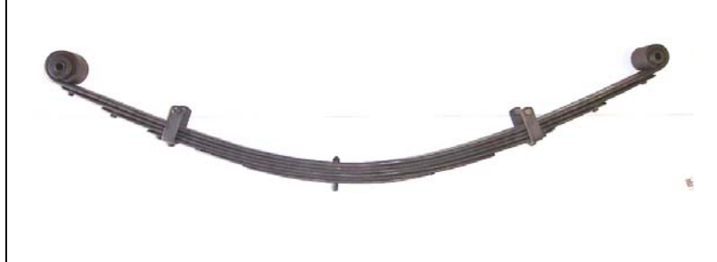
< Frame end (Large Bushing) - Photo 3-B - Shackle end >